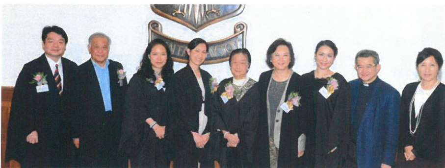
St James' Church Choir Room