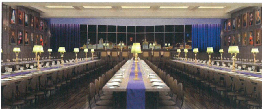
The Danny Ho Bradbury Hall, St John's College